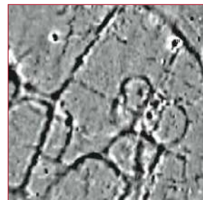
Example of survey from Grad601-2 plotted in TerraSurveyor

TerraSurveyor and TerraSurveyorLite demonstration versions can be downloaded from the DW Consulting website at www.dwconsulting.nl .