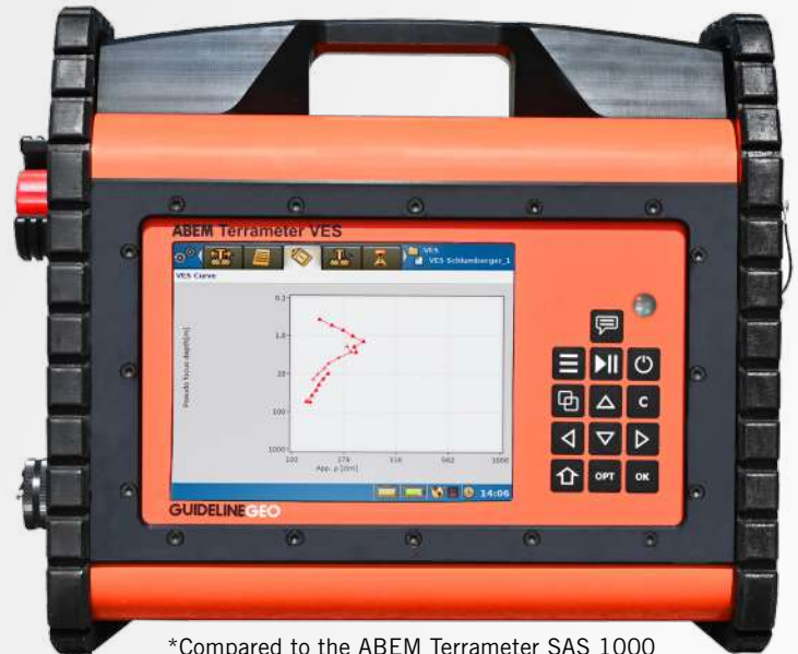
*Compared to the ABEM Terrameter SAS 1000