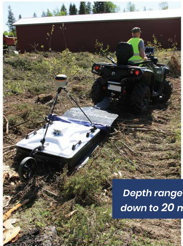
*Figures for guidance only. GPR works best in high-resistive soils, absent of conductive layers. The actual depth range is dependent upon the di-electric properties of the ground or penetrable material under investigation.

Compatible with DGPS or RTK-GPS for higher accuracy geo-referencing for mapping/ reporting purposes